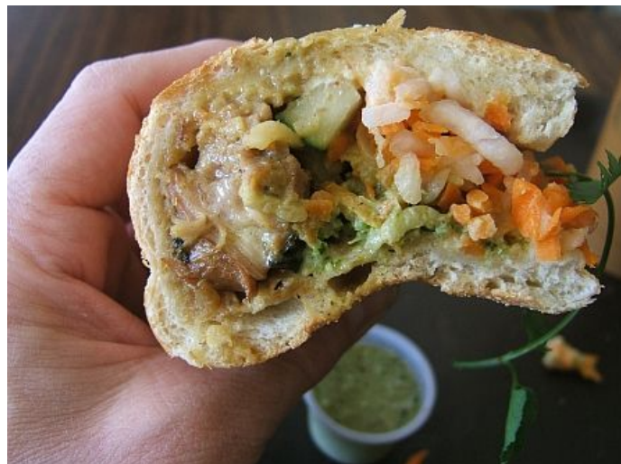
Taiwanese chicken and Peruvian aji verde combine for a lavin of flavor.