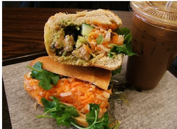
Behold: The Lin-Sanity bánh mi

Tagged in: Vietnamese , Taiwanese , Peruvian , Jeremy Lin , Elmhurst , chicken